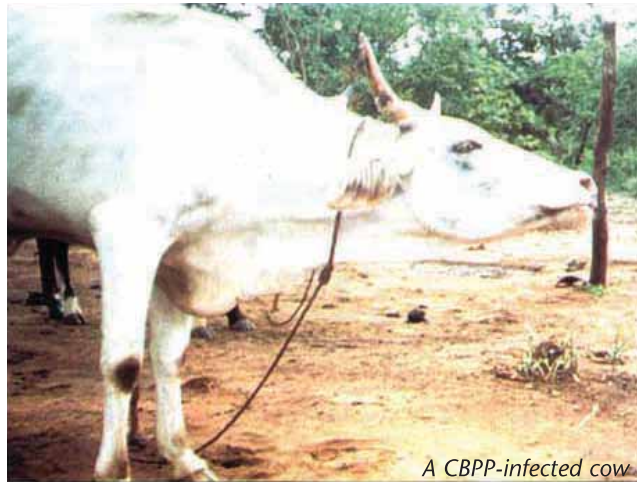
A CBPP-infected cow.

Only Botswana has managed to eradicate the disease by this method; for most other African countries it is not feasible, for a variety of reasons (e.g. lack of money for compensation, understaffed veterinary services, dif-