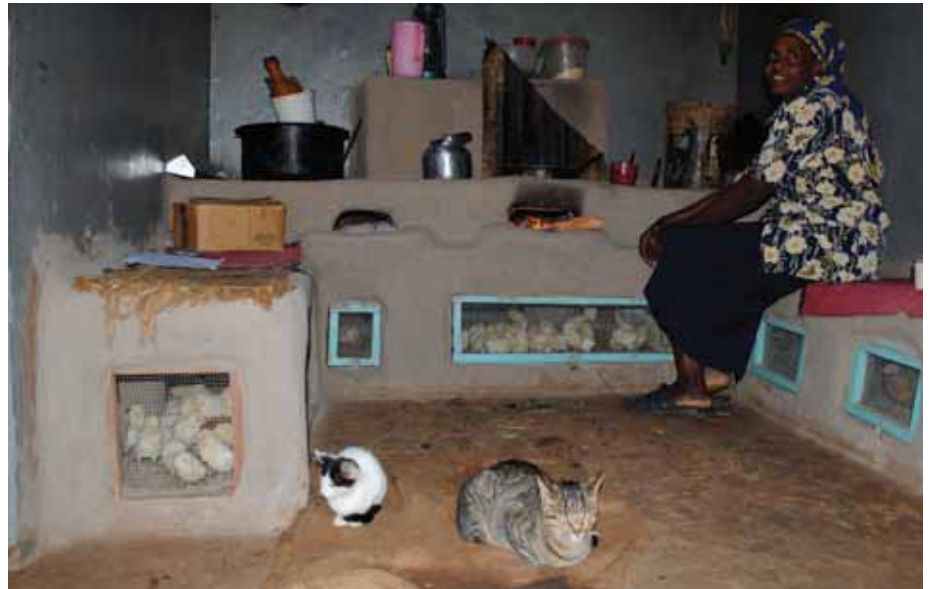
A home-made brooder (above). Energy that would otherwise be lost after cooking is used to keep the chicks warm. A fireplace with chick brooder under construction (below).

The opening is covered at night in order to preserve the heat. On the outer side of the wall, there is a resting area for