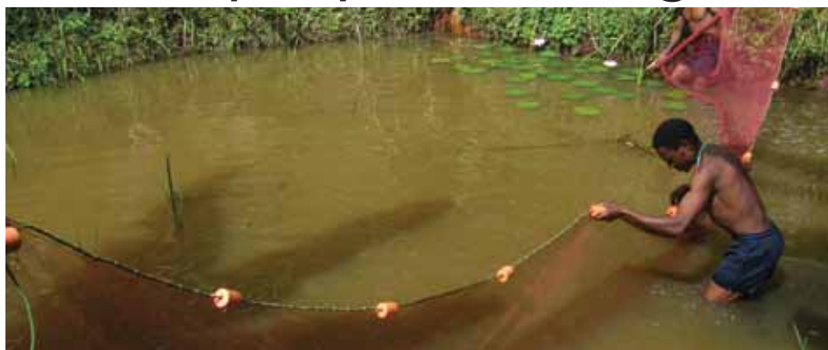
Fish farmers harvesting fish from a pond.

Feed processing usually includes a number of steps, including grinding, mixing, binding together, fat coating, drying/cooling, crumbling, and bagging. In the East African region, most on-farm feed preparations are made in small quantities, using improvised machinery that is operated