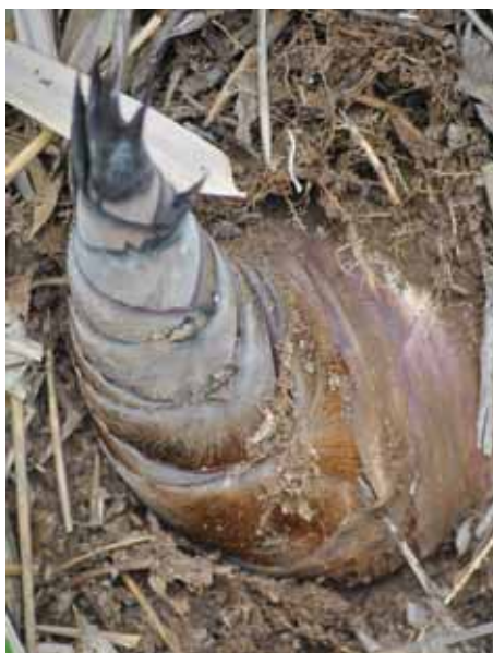
A Nigra bamboo bush (top). An edible bamboo shoot (middle) and bamboo cuttings in the nursery (below).