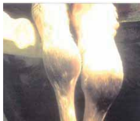
Joint-swellings: A symptom of CBPP

The most widely used vaccine is T144, produced by the Kenya Veterinary Vaccines Production Institute in Nairobi/