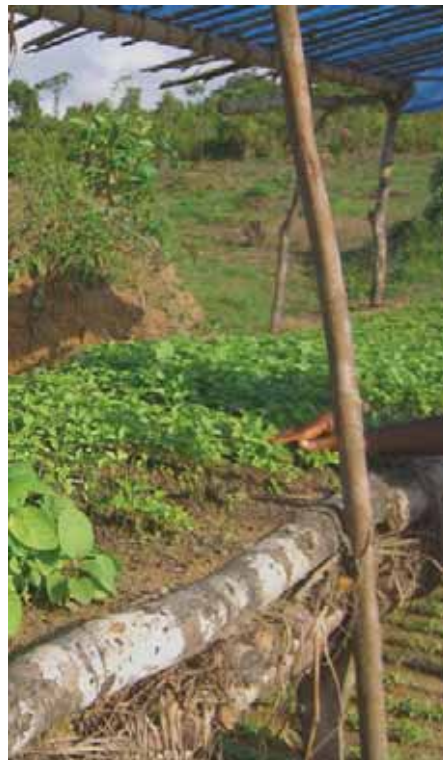
Seedlings on a raised seed bed.

It is important not to apply any fertilizer. Young seedlings need soil low in nutrients, but they love loose, airy soil. Therefore, it is advisable to add some sand, sawdust (not from eucalyptus),