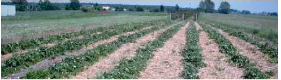
The mulch between the strawberry lines protects the berries and keeps the soil moist.

For the same reason, strawberries should not be grown close to these crops. On the contrary, intercropping with beans, spinach or onions can be very beneficial.