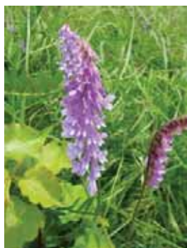
Leguminous green manures such as mustard (above) and desmodium (left) add nitrogen to the soil apart from increasing organic matter that helps improve soil structure.

green manure should be combined with the recycling of nutrients in the form of manure or compost, because all the nutrients in the harvested crop residue are removed from the shamba and not recycled, which will affect the nutrition of your future crops.