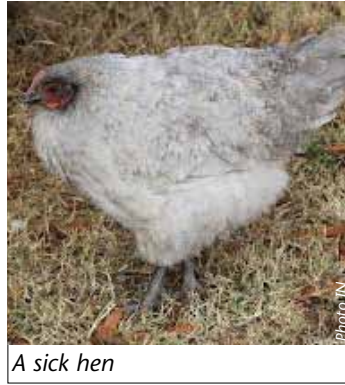
A sick hen

kill any disease-causing germs or viruses.