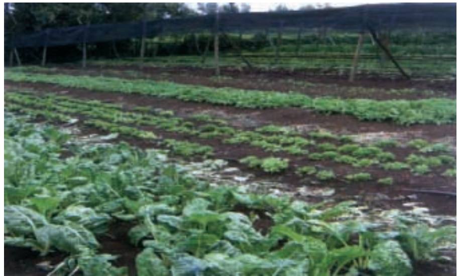
Su Kahumbus vegetable garden in Tigoni is a model for all organic farmers in Kenya.

However marketing is a rigorous exercise involving tough negotiations with the companies. They sell her products at a higher price than conventional farm foods. This is because organing farming requires more labour than conventional agriculture. "It needs much less time to apply a bag of chemical fertilizer on the garden than to produce compost,