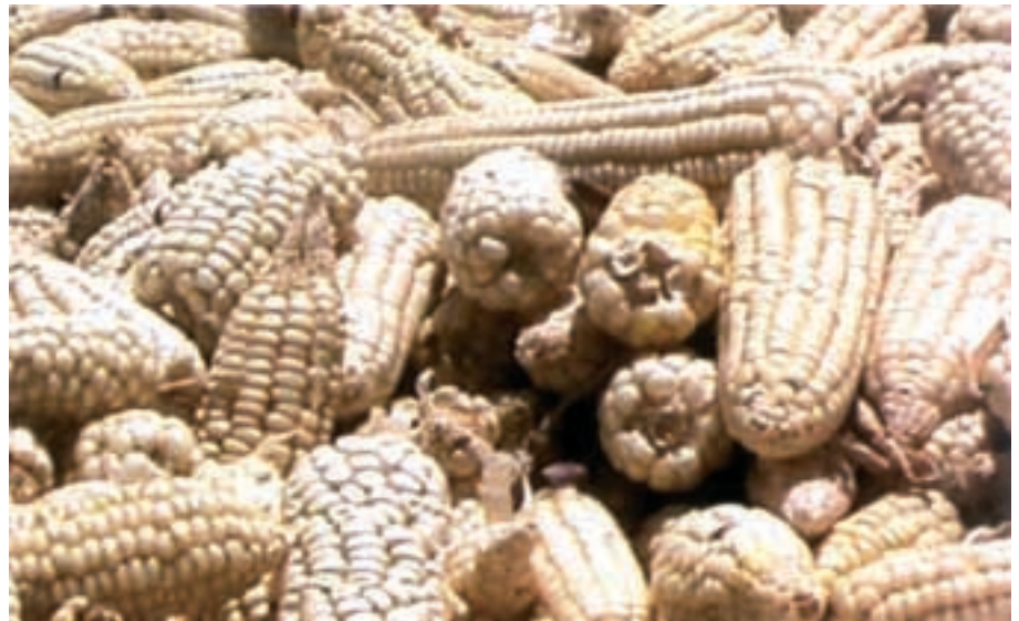
Not all maize can be used for seed.

One of the ways in which farmers can produce seed is to set up their own community based seed banks- this is a community managed seed storage facility in form of pots, gourds or