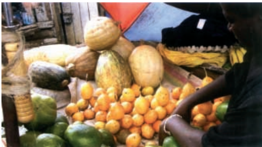
Farmers can increase their income if they can find good markets.