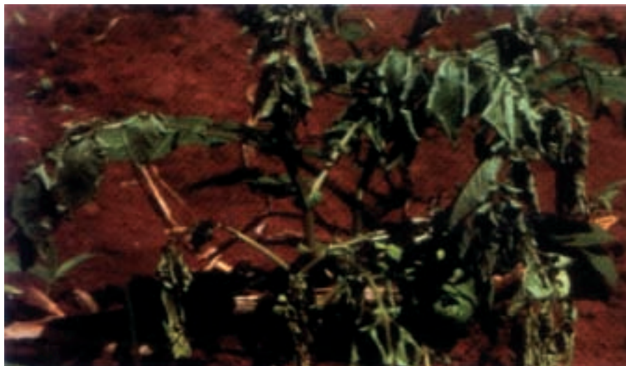
Potato plant affected by Bacterial Wilt caused by Ralstonia solanacearum .

The newspaper for sustainable agriculture in Kenya Nr. 2 May 2005