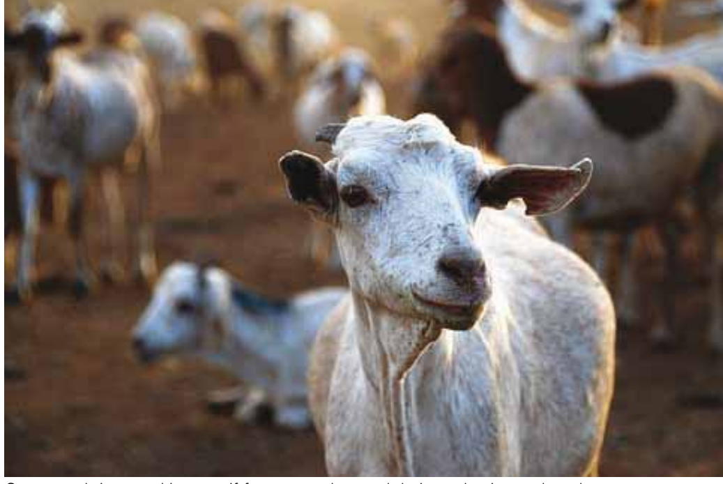
Goats can bring good income if farmers understand their production and market.

meat and more meat means money. A random sampling of customer preferences in major towns reveals that consumers prefer meat that is tender - easy to chew, with less fatty tissues. Tenderness is a very important factor when it comes to meat quality. Factors that influence tenderness are: the animal's age at slaughter, the amount of fat and connective tissue. Goat's meat is tender when the animals are slaughtered between 5-8 months of age.