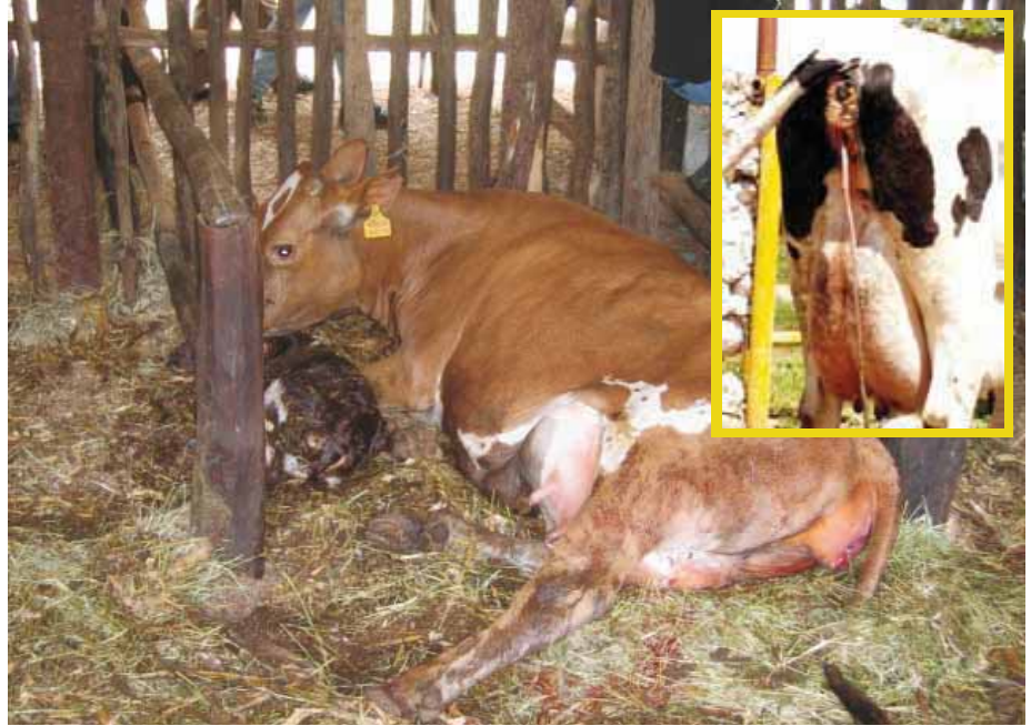
After delivery observe carefully to ensure that the cow drops the placenta

Abortions and premature calvings. The birth may occur normal but the placenta may not detatch itself from the uterus lining thereby causing the problem of retained afterbirth.