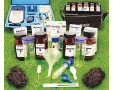
A soil test kit, unfortunately it is not avai-lable locally

Farmyard and liquid manures are a good source of nutrients for all crops.