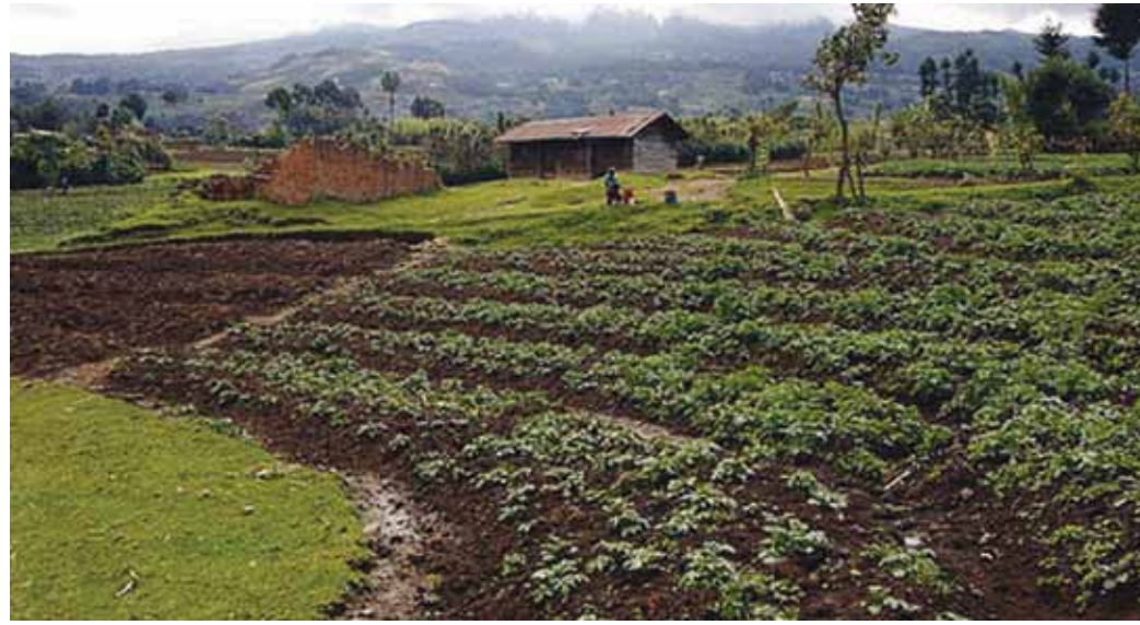
Fertile soils bring good crop yields and income for the farmer

Various manures such as slurry and plant extracts such as that made from Tithonia provide nutrients that can be applied in diluted form to growing plants. These can effectively meet the nutrient requirements of any crop and can be used to replace chemical fertilizers, in the long term. Farmers can also make Fermented Plant Extracts (FPE). Plants with various nutritional values such as stinging nettles, neem, comfrey etc, are mixed with EM1 and molasses to make a solution. It can be applied on crops to feed and protect them from diseases and pests (See TOF Nr. 24 May 2007).