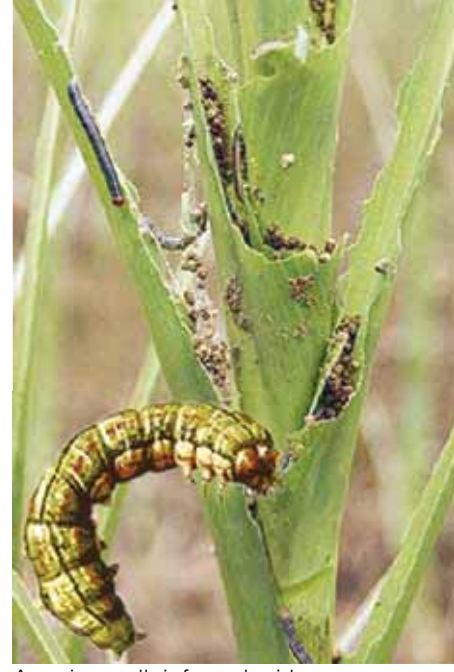
A maize stalk infested with armyworms

Many animals, birds and insects prey on the African armyworm at different stages of its lifecycle. These natural enemies should be encouraged to thrive by maintaining natural surroundings with plenty of breeding places for them, including trees and