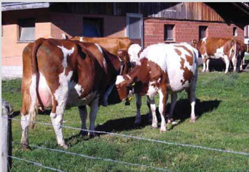
A herd of Simmental-Fleckvieh crossbred dairy cows in a Swiss farm.

Fleckvieh character: The breed is a dual-purpose cow that can be used for both dairy and beef production. Compared with the Holstein-Friesian, Fleckvieh produces less milk and is consistent in production; but it requires less feed to produce the same amount of milk as a Holstein-Friesian. Therefore it is an efficient cow. According to many comparison studies, done in Switzerland, Germany and also in South Africa, Fleckvieh gains faster weight than other breeds. It is less susceptible to diseases such as mastitis and even ECF. It has proved its qualities in the European lowlands as well in the mountains. These qualities