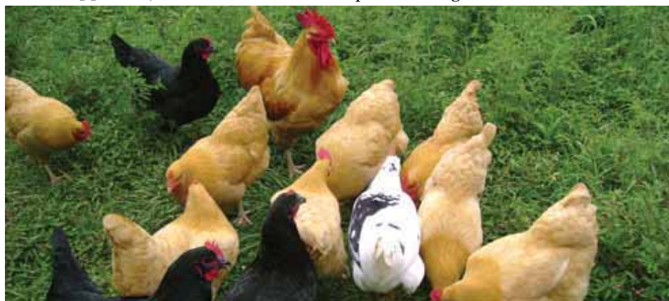
Good housing and proper feeding are very important in poultry keeping.

Reputable vets are well known through farmers' experience. Farmers in your locality can advise you on the best one from their own experience and past records of their performance. Sometimes it is important to rely on qualified veterinarians although their charges are much higher than those charged by animal health assistants.