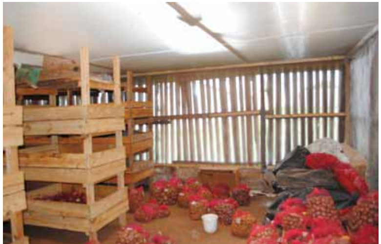
Seed potatoes in a Diffused Light Store (DLS) (above). The more the sprouts in a potato seed tuber (below), the higher the yield.