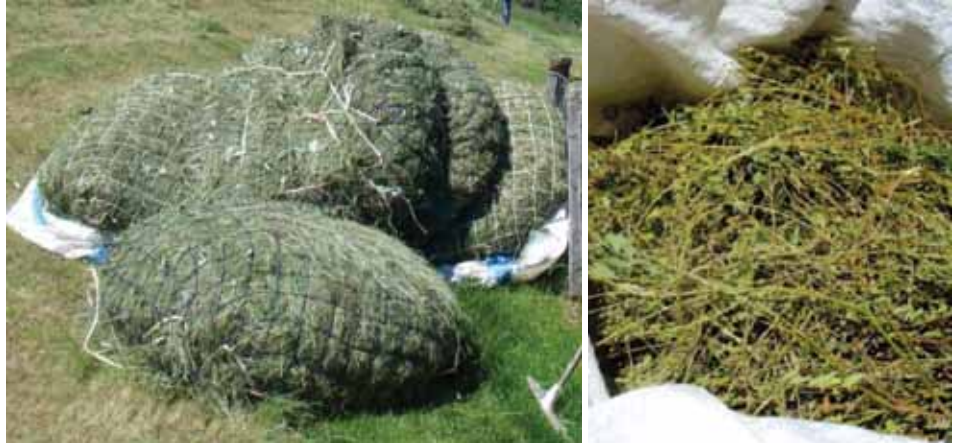
The green colour of dried hay indicates it is still nutritious. Dried, green leucaena hay(right)

You may supplement the hay with dairy meal and with fresh or dried leaves from fodder trees. Always offer mineral licks and sufficient water to your animals at all times.