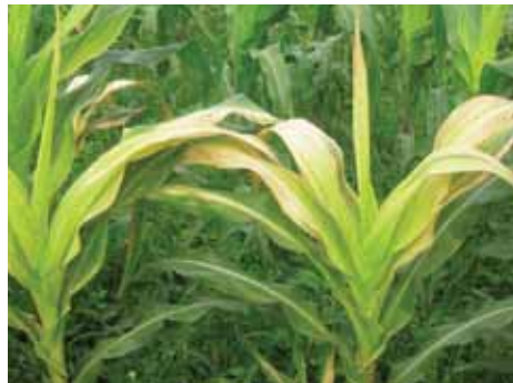
Maize plants infected by MLN disease start drying from the leaves downwards.

All varieties of maize planted in all above-mentioned regions are affected by the disease, which reduces the crop options for farmers. Research institutions have set up two trial sites in Naivasha and Bomet to test the resistance levels of different maize varieties to the disease. The disease has no cure.