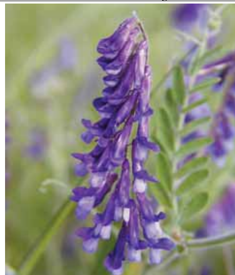
Purple vetch can accumulate 90 kg of nitrogen per acre and will provide about 45 kg of nitrogen per acre to the subsequent crop.