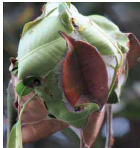
Weaver ants derive their name from the way they weave their nests using plant leaves.

This article is a translation of a text published in our sister magazine, Mkulima Mbunifu, which is distributed in Tanzania.