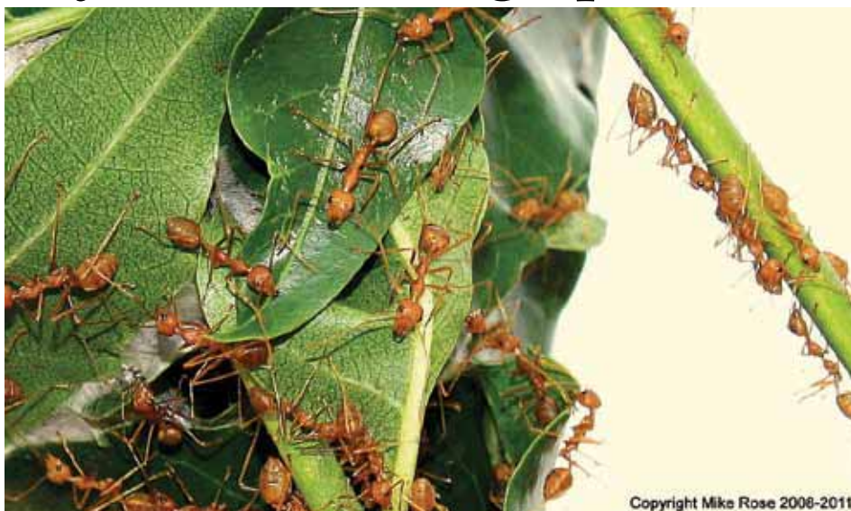
Weaver ants (above) eat fruit flies (right), their larvae and other pests thus controlling them naturally.

Weaver ants consume a large amount of food, and workers continuously kill a variety of insects for this purpose. Because weaver ants prey on harmful plant pests, any plant inhabited by weaver ants has low pest levels. Weaver ants have proved to be effective bio-control agents against agricultural pests especially in horticultural crops such as mango and cashewnut plantations. Fruit trees harbouring weaver ants produce