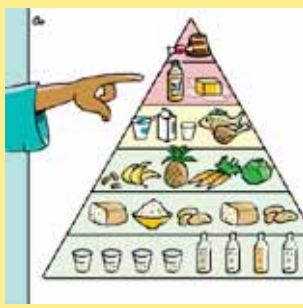
Drink enough water, eat lots of fruits and vegeta-bles. Make sure that you eat enough carbohydrate like bread, rice or pota-