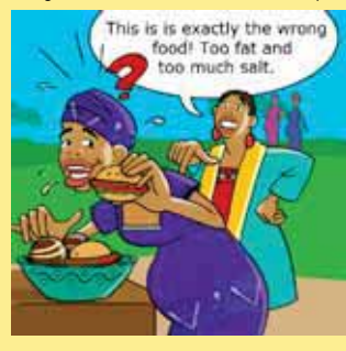
Even if you have cravings, avoid unhealthy fast food. Balanced diet will always give your body proper nutrients