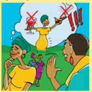
Lead a healthy lifestyle. Avoid alcoholic drinks or smokina.

Look out for out next topic: Danger signs in pregnancy!