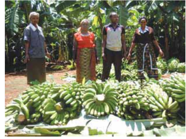
middlemen who used to buy Member display bananas during a market day

Banana sales take place twice a month. The market is open for non-members from the area. Unlike middlemen who would estimate the weight, the banana