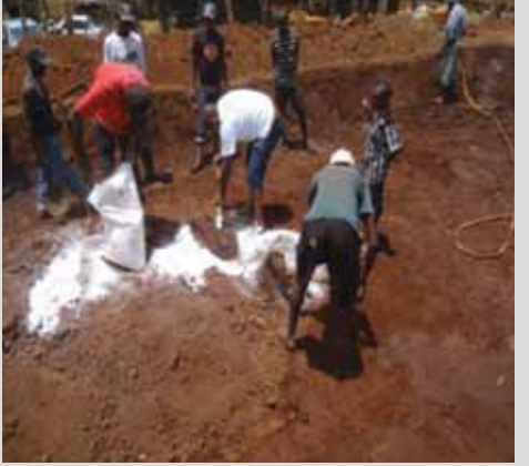
Mixing soil with lime (left). Preparing mud for plastering (right).

Farmers who want to avoid this problem of overcrowding are advised to stock monosex (males only) Tilapia fingerlings. These grow to good market weight fast because they cannot breed in ponds and are harvested all at the same time. For instance if a farmer stocks 1000 fingerlings in a 300 m<sup>2</sup> fishpond, and feed them well, they will normally mature after the 6th to 10th month depending on the water temperature and management. The market price ranges from between Ksh 250 to 300 per kilo, therefore a farmer can easily make an income of Ksh. 90,000 in a year.