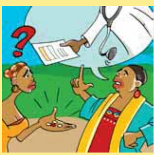
Take medicine that has been prescribed by a doctor or a health worker.