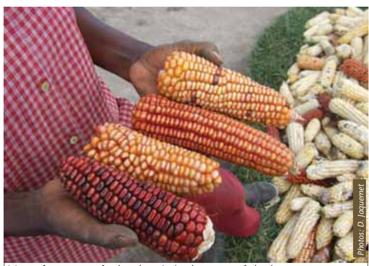
Many farmers prefer local varieties because of the better taste.

Last year, as usual, she bought a bag of hybrid seeds to mix with her own. Unfortunately, at harvest, she discovered that most probably she had been sold fake seeds. The maize cobs from those seeds were smaller, compared to the ones from her local seeds. This is when she decided to stop buying hybrids and also resolved to exclusively rely on her own improved local varieties. She can sell them at a slightly higher price than the hybrid ones; she knows that many small-scale farmers in the neighbourhood prefer the local maize since they are tastier compared to foreign ones. Rachel grows Katumani, Githigu, Mukuyu and a red one of which she doesn't know the name.