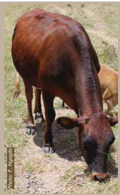
the feeding schedule.

Health: When done well, these records show the health conditions of the animals and are important in selection of animals for breeding and culling those with health problems. It also shows the schedule of vaccinations and other management practices like deworming, and the cost of such practices.