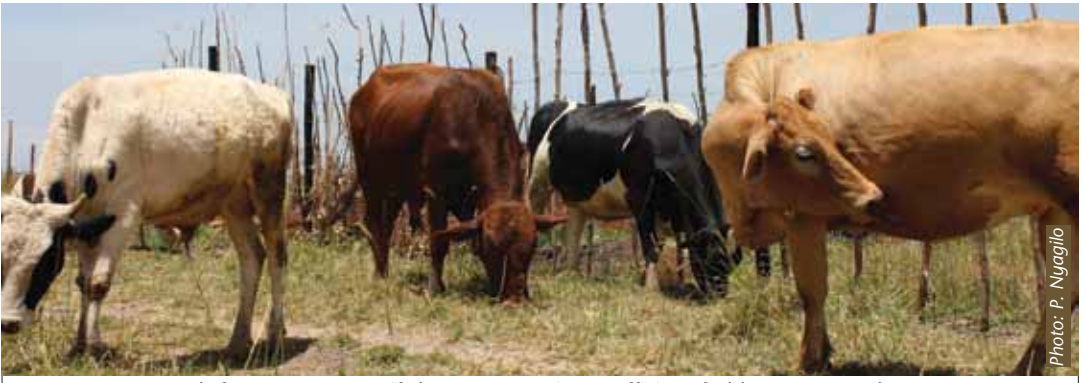
Do not expect much from your cows, if they are not given sufficient fodder, water and care.