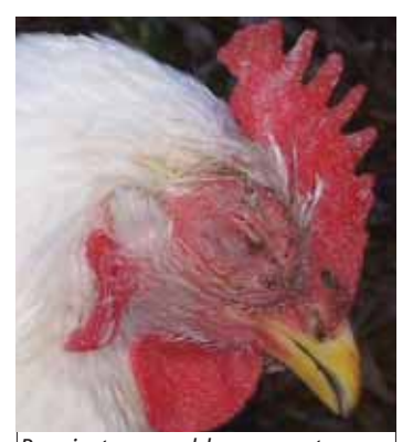
Respiratory problem symptoms: Watery eyes, swollen sinuses, sneezing and difficult breathing.

External pests such as lice, fleas, ticks and mites suck the blood of the birds and cause weaknesses plus a drop in egg production. Disinfect the poultry house and treat the affected birds with sprays or powders. Soft ticks (kitungu) are a special problem