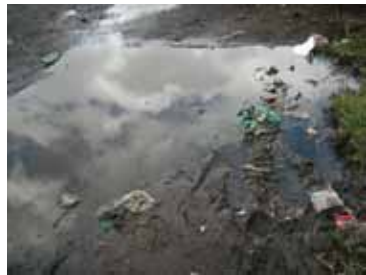
Water puddles are breeding places for mosquitoes. Mosquito nets are safe if well maintained.

The problems began when DDT was used increasingly and in huge amounts in agriculture to eliminate insect pests, accelerating the emergence of resistant mosquito populations. Because of its risks, DDT was banned in the 1970's. There are fears that DDT, intended for public health use, may be diverted to illegal agricultural application. Even if this would not be the case, the reintroduction of DDT is controversial as the so called DDT-conflict in northern Uganda between 2008 and 2011 demonstrated.