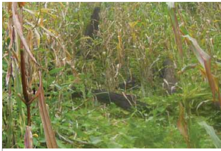
A responsible farmer checks the maize fields for signs of disease

Crop rotation: Plant the maize on a plot where there was no maize crop for two to three consecutive seasons. Thoroughly clear the farm of weeds since they can host some pests.