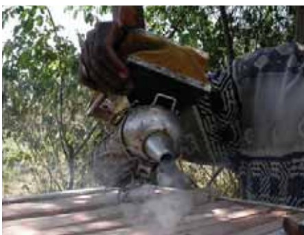
Well maintained beehives, good equipment and proper handling are conditions for harvesting clean honey.