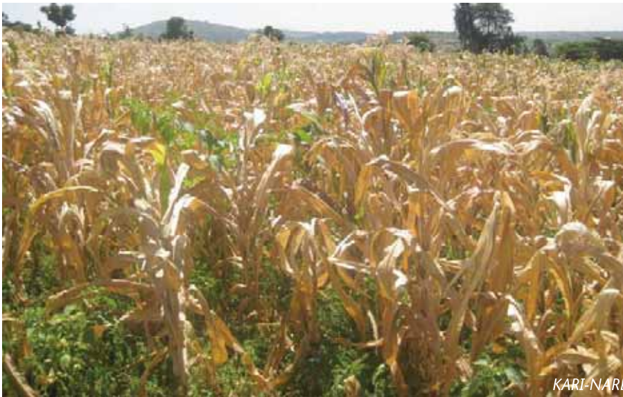
An infected maize crop: The disease can destroy an entire maize field in a short time.

An unknown maize disease has been discovered in Bomet and could spread to the rest of the country.