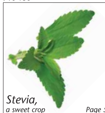
Stevia, a sweet crop

Many farmers groups are unable to receive copies of The Organic Farmer magazine for one reason or the other. We know that many addresses have changed due to closure of post office rental boxes or transfer of persons who receive the magazine on behalf of fellow farmers; or some institutions keep TOF in their offices instead of distributing the magazine. If your group is affected, do not keep quiet. Farmers should raise any issues or problems they face in accessing the magazine. This will help us to streamline the distribution of the magazine and ensure it reaches every part of the country. Write to us on the following address: The Organic Farmer P.O. Box 14352, 00800 Nairobi, send us an e-mail ( info@organickenya.org ) or call us on following mobile numbers: 0738 390 715, 0717 551 129, SMS: 0715 916 136