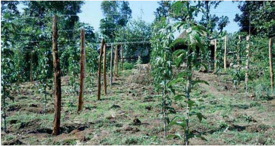
A passion fruit orchard belonging to a member of Chebugundi progressive group.