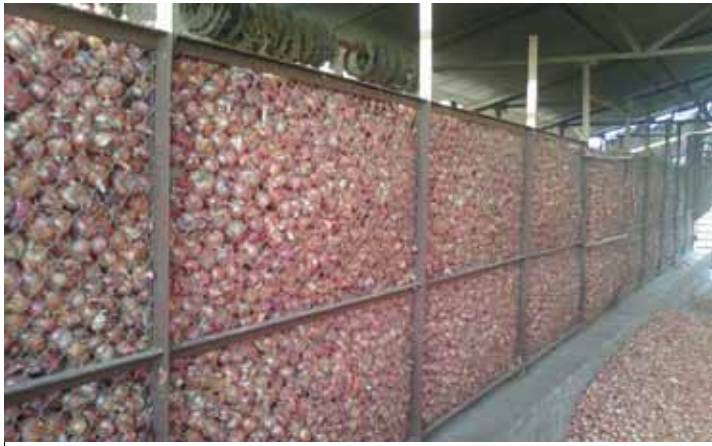
An onion store requires good ventilation for proper drying and prolonged shelf-life to reduce loses associated with rotting.