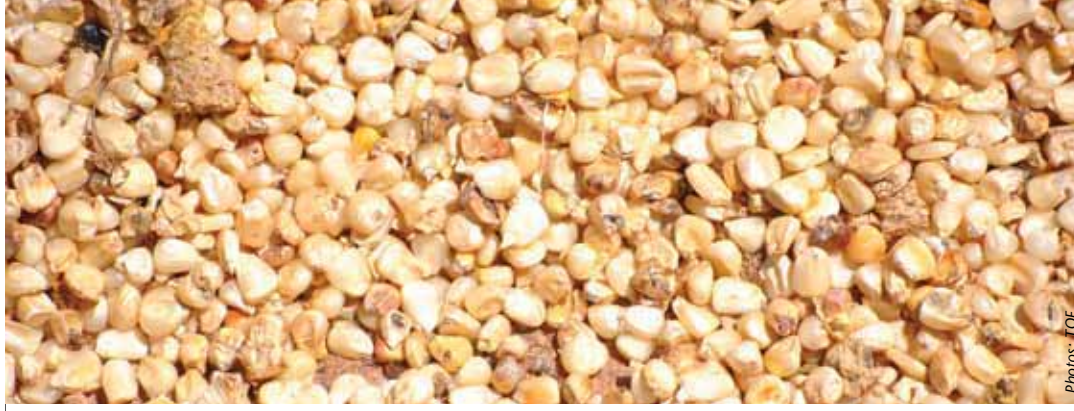
The maize shown above has almost 50 per cent damage due to late harvesting and poor storage. Farmers should always ensure maize is harvested early and stored in good sheds.

Storage is the other big challenge for farmers. Most farms do not have stores where the grain