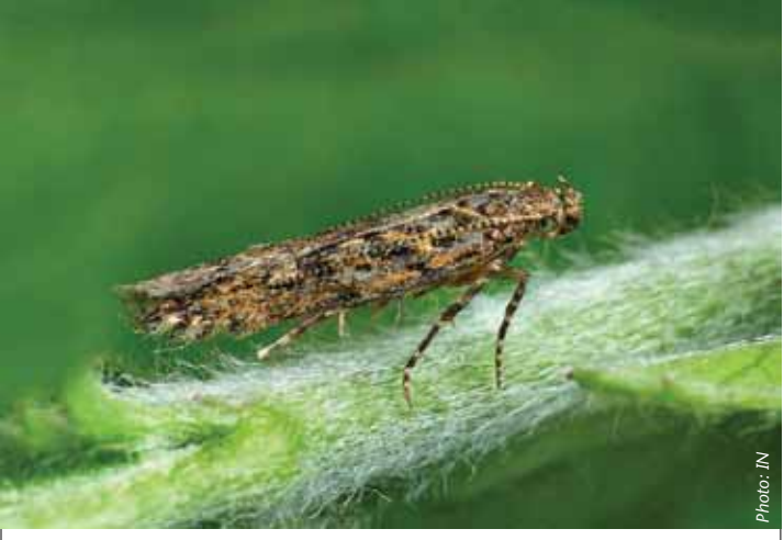
The Tuta absoluta is one of the most destructive pests.

Even more worrying is that the pest has been found to be resistant to most of the chemical pesticides in the market, leaving scientists with no option but to work on its control through