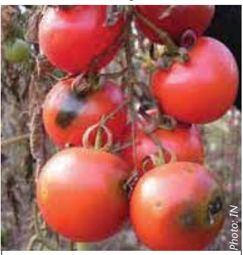
Infested tomato fruit.

Scientists in Africa are working to develop a comprehensive package for managing this pest using environmentally friendly methods. Meanwhile scientists at icipe are advocating a number of biological control measures that can manage the pest population and reduce damage to tomatoes.