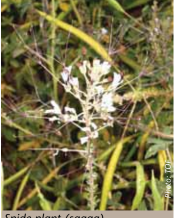
Spide plant (sagaa)

The changing eating habits have affected the production and consumption of the African indigenous vegetables. People somehow relate them to the older people while others take them as poor man's food that should be used as a last resort. The larger population has a preference for the exotic vegetables and foods. The rural communities find themselves consuming the exotic species as they try to imitate the urban population's