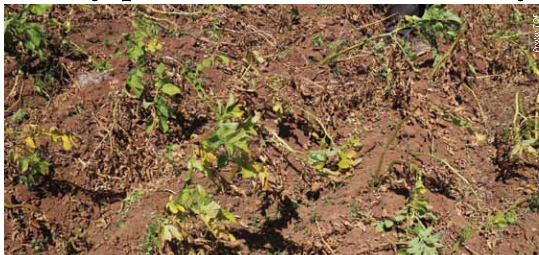
A farm devastated by whiteflies in Bomet County. The potato crop has failed in many farms.

For example, farmers interviewed in Bomet indicate that one of the major chemicals they have been using to control the