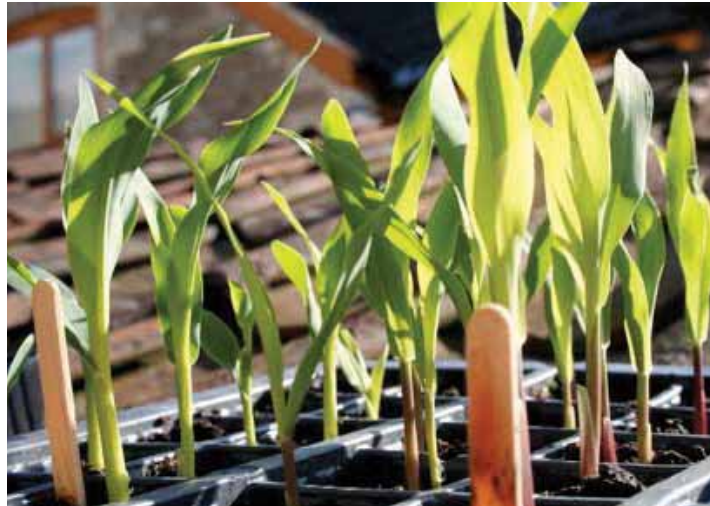
Seeds are specially developed for specific regions in the country. A lot of laboratory and field tests are carried out to ensure quality.

Pwani hybrids are fairly short varieties resistant to lodging and more tolerant to moisture stress and recommended for altitude range of 0-1250 M above sea level with 400mm of rainfall. It has an added advantage of good husk cover hence reduced crop loss through bird and weevil attack. It is also suitable under inter-cropping systems.