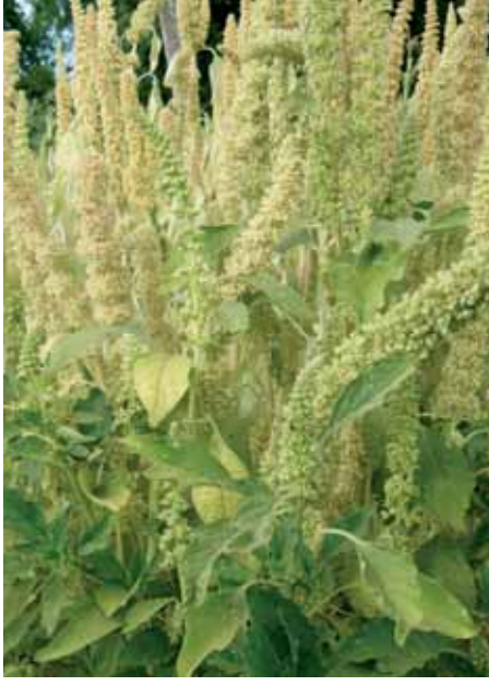
Amaranth improves nutrition

Tel: 020 445 03 98, 0721 541 590 e-mail: info@organickenya.com