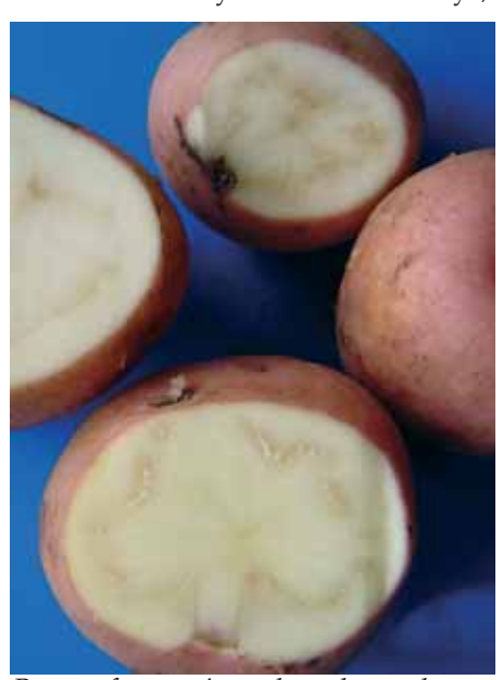
Potatoe farmers incur huge losses due to bactarial wilt

How do the chemicals get out of the plants and into the soil? The answer is short: The chemicals are released when the cell walls of the fresh plant are broken down. Chopping plants very finely is the best possible option. But there still remain large pieces of unbroken leaves in the field. Phillippine farmers use a rotary hoe or rotavator to chop leaves and mix them into the soil. With this method, they reduce bacterial wilt by 50-70%. In Kenya,