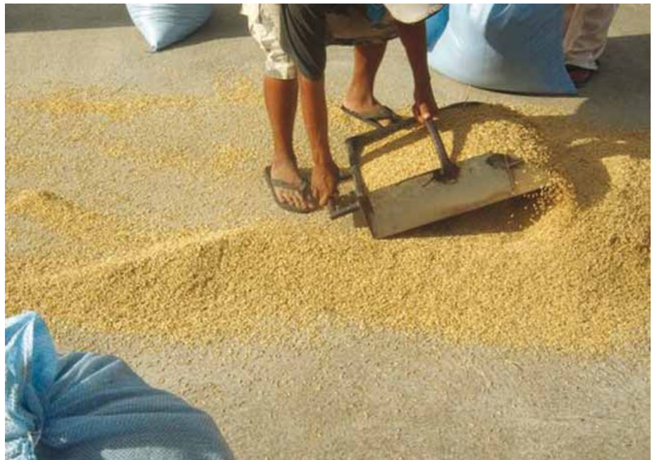
A good harvest does not always guarantee good income for producers

On our second trip we have to hire another lorry and a tractor to transport the wheat from the shamba to the lorry, which stops at a safe distance to avoid