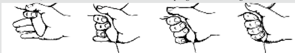
The "squeeze"-method as shown in this illustration is the best method to milk cows and goats.

When the fore-udder is nearly empty, change to the back two teats. When the milk flow ceases, you may go back to the front teats, or you may let the calf finish off and take the last few drafts. If the calf is already weaned or is not allowed to suckle, the best practice is to use an effective teat dip right after milking.