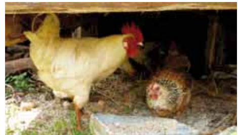
The winner's well-managed farm is a model to other farmers, schools and agricultural institutions who come to learn from him. Ibrahim Wakayula (inset)