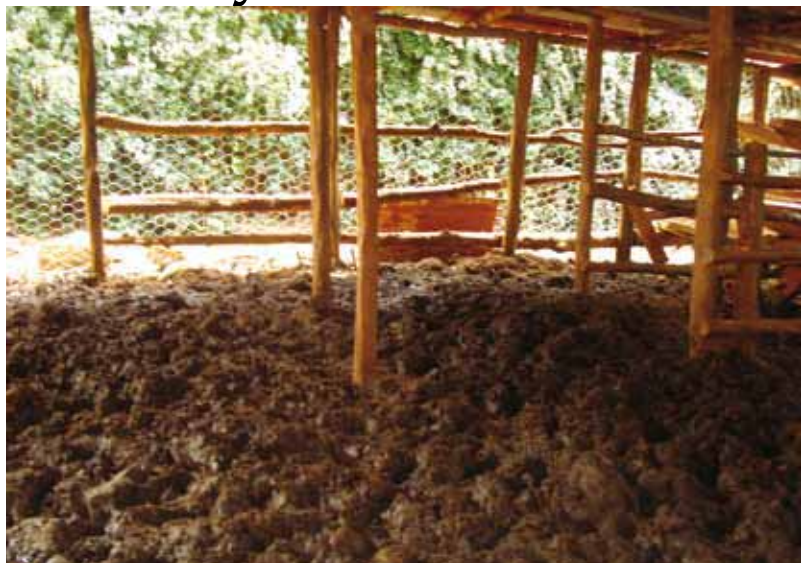
This cowshed is not a comfortable place for a cow

you may spread the disease from sick cows to healthy ones and from affected quarters to healthy quarters.