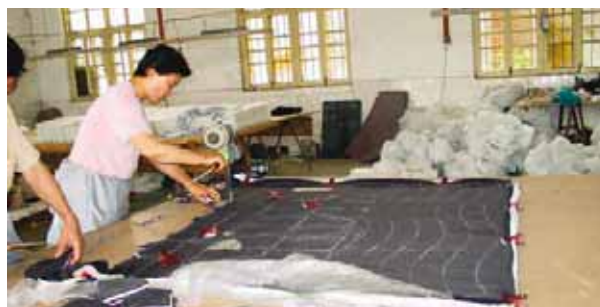
Workers in a Chinese factory making jackets from rabbit skin