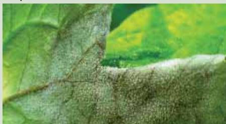
Characteristics of Botrytis are the grey spores

sider your management. Plants that are weak, e.g. from lack of nutrients, lack of water, over-watering, or insect-infested plants are attacked more easily by fungi and other diseases. Ensure good drainage of the soil, give the plants enough space and air, and be careful with watering. Remove damaged plant material as soon as you notice it. You may protect your plants by applying fungicides whenever the weather is very wet. Copper fungicides, neem oil, or potassium bicarbonate may be helpful.