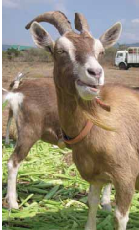
Proper feeding increases a dairy goat's milk production and improves its health

It is important to know how a dairy goat's digestion works. The main difference between a goat and a cow or a