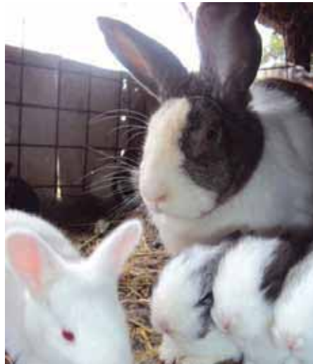
A dutch brown grey with her young ones

This is true, but this is not really an organic solution. It has happened by chance that certain people noticed that rabbit urine was making their lawns turn yellow and eventually the grass would not survive. But yes it works against all grasses, not only couch grass.