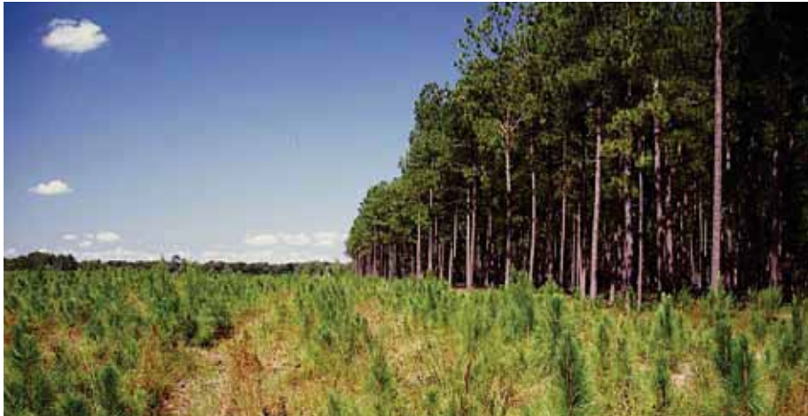
Reforestation and conservation of forests needs proper planning.