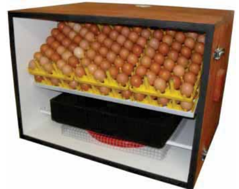
This Surehatch model 270 incubator is fully automatic and has a capacity of 180 in setter trays and 90 eggs in the hatcher. It costs Ksh 120,000. Surehatch offers small and large models.

Thermometer and hygrometer: These two monitor the incubation temperature and humidity inside of the incubator respectively. The readings can be taken from the outside through the observation window.