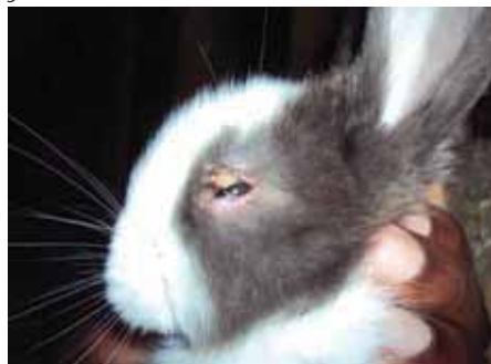
Eye infection can blind your rabbits. A good farmer observes their animals every day. Treat with recommended eye ointment.