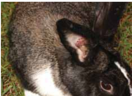
Ear mite can cause infection and brain damage. It should be treated immediately with neem oil or liquid paraffin.