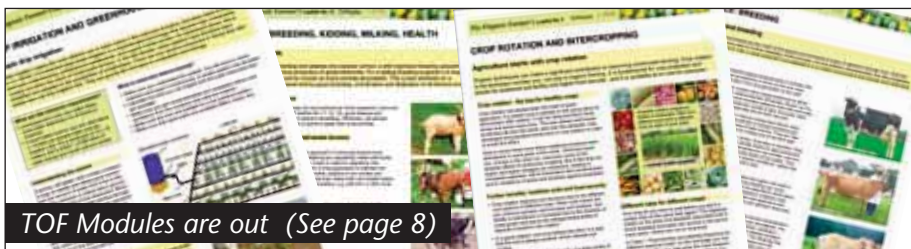
TOF Modules are out (See page 8)

NGOs and the Government promise donors that they want to put up information systems for farmers by installing computers in every corner of the country. In theory, this is a good trend – but it is window-dressing: Lack of electricity, poor infrastructure (roads and schools) and lack of finance (credits) remain the biggest hurdles for rural development. If we really want to better the livelihood of the small-scale farmers, we need to invest much more in these key areas – more than in anything else.