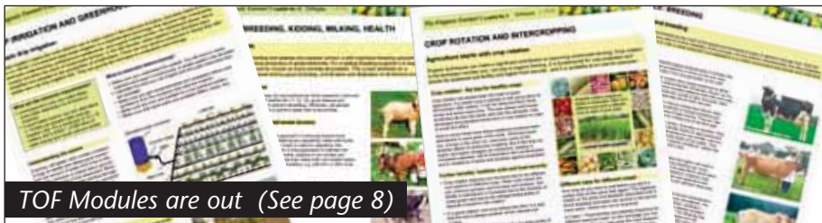
TOF Modules are out (See page 8)

The Kenya Forest Service (KFS) has advised the government to lift the ban on logging. It has already mapped out areas of harvesting, including felling plans. The problem can only be solved if the government has a clear strategy on how to balance individual interests and the conservation of forests for the common good of the country.