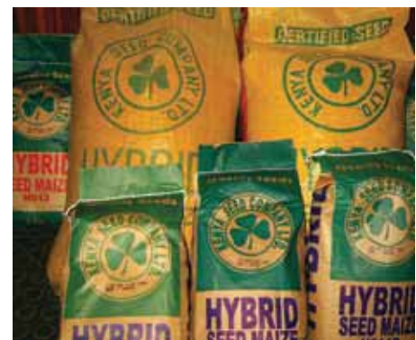
Always check for a KEPHIS tag inside the seed pack, or KEPHIS lot number on the pack.