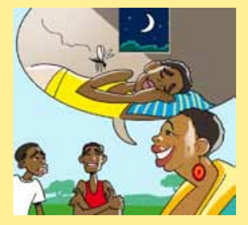
You can only get malaria if you are bitten by an you are bitten by an infected mosquito, mainly