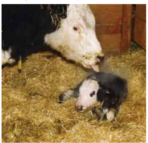
A new born calf needs good bedding.

Three to four weeks before calving, a dairy cow's stomach needs to be prepared for the high fodder and concentrate quantities required after calving. This is called "steaming up". Resume feeding concentrates in increasing amounts: by the time of calving, the cow should get 4 kg concentrates per day. At the same time, reduce mineral supplements to a minimum! This will prevent milk fever through activating the calcium stores in the bones. Resume feeding minerals only one week before