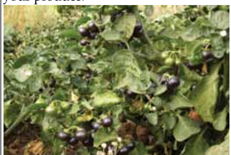
Black nightshade (managu) plant.

If there is a market for any of them and you can be able to sell at a convenient price, you should of course go ahead with it! But first make sure you have reliable partners and or buyers for your produce.