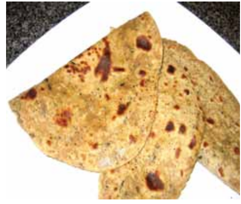
Chapati made from soya flour.

The Organic Farmer is an independent magazine