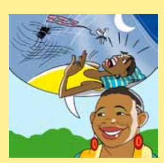
Now you have a torn net! mosquitoes will get