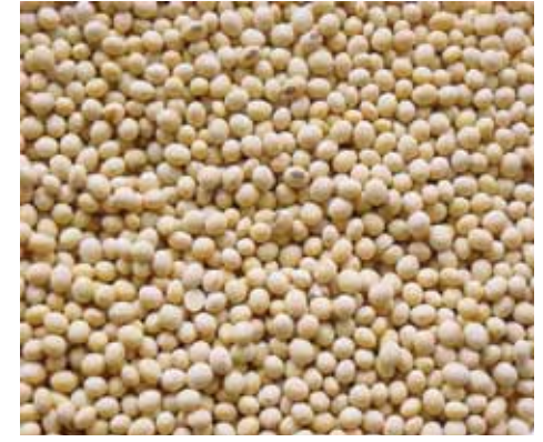
Soya beans being dried

They like well-drained, fertile soils. Farmers should add one handful of farmyard manure or well done compost