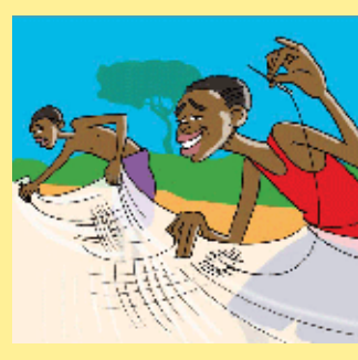
ed nets, you are protected from With fixed nets, better mosquitoes