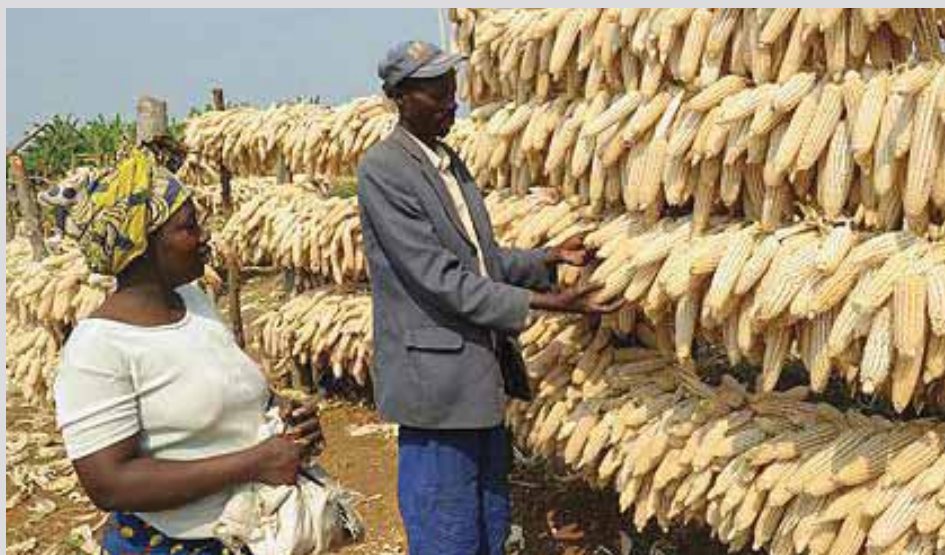
It is advisable to dry your maize before storage to avoid aflatoxins infection and rotting.

The Aspergillus flavus fungus invades and infects developing maize grain in the field before harvest, especially when the maize remains too long in the field; that's a reason why maize should be harvested early. The fungus affects mature grain during harvest and in storage as well. In stored maize, the fungus can develop further through improper grain drying and unhygienic storage practices. Pre-harvest contamination with aflatoxins is aggravated by drought stress and elevated temperature during seed maturation. Damage through broken grains and holes drilled by pests such