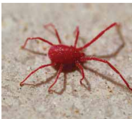
Phytoseiulus persimilis and Amblyseius cucumeris, two predatory mites bred by Real IPM. They are not even half a millimetre small, but can control pests effectively.

lack of crop rotation, can be largely overcome. Many customers using biological control methods are running large greenhouses.