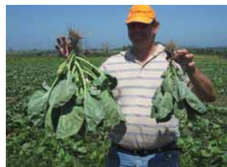
Sukumawiki grown with Trichoderma (left) and without Trichoderma application (right).

"Our crops look happier since we use biological control", he says. The company also contracts small scale farmers. He says that limitations for small-scale farmers are equipment and technical skills. "We recommend our farmers to use those products that are easy to handle. Trichoderma , for example, is easily available and a very effective biofertilizer that improves root