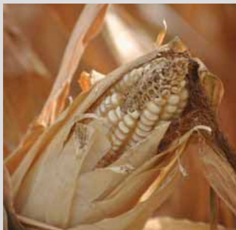
After maturity the maize cob opens exposing it to aflatoxins, rotting and pests (above). Even healthy looking maize may have aflatoxins (below).