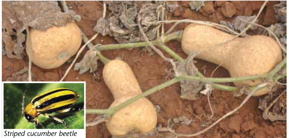
Striped cucumber beetle

Aphids, Whiteflies, fruit flies: Neem products can control these pests, there are neem products in the market which are allowed in organic farming e.g. Nimbecidine®.