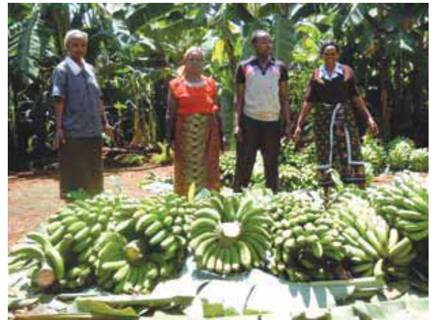
Member display bananas during a market day

Banana sales take place twice a month. The market is open for non-members from the area. Unlike middlemen who would estimate the weight, the banana