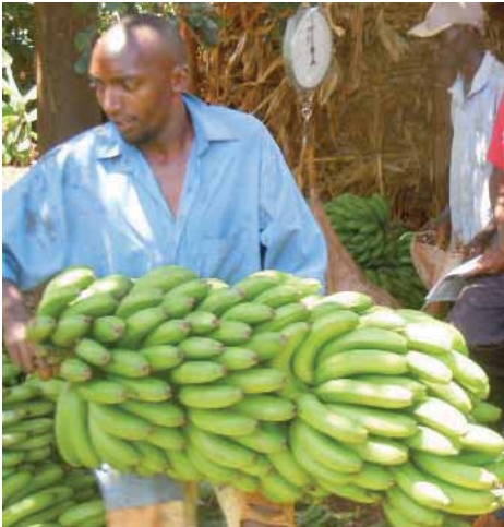
A member carries a banana bunch

Murang'a introduced tissue culture bananas to the group to increase their production and attain both quality and quantity. By then, the group planted 7,000 seedlings in the first phase and 20,000 in the second phase, totaling to 27,000 plantlets within a period of one year. Today the group has a total of over 50,000 banana plants that bring a good yield.