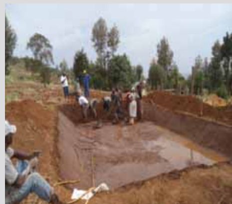
Mud is spread (left), a thin mud paste is smeared and water added to avoid cracking (right).

mix the red soil and the agricultural lime and water into a thin paste at a ratio of 1:5, (again a fisheries expert may help here) and smear it over the surface to eliminate all spaces that might have been left during the initial plastering. • Ensure the surface does not dry by continuously sprinkling with water as you smoothen the surface of the pond.