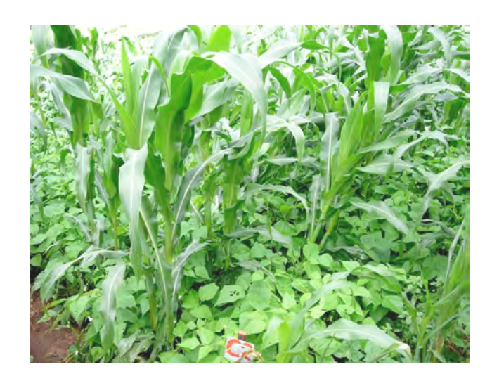
Good for the crops, for the soil, and for human nutrition: Maize-bean intercrop

Try to keep the recommended rotational intervals at least for important legume cash crops such as French beans or peas. They will then do much better!