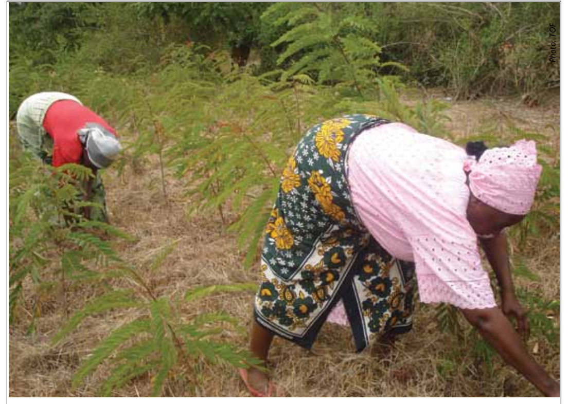
Women tend to calliandra trees in Chyullu village, Kitui county. Just like crops, trees require great care in order to grow to maturity. Most trees fail to attain maturity due to lack of care.

The magazine for sustainable agriculture in East Africa