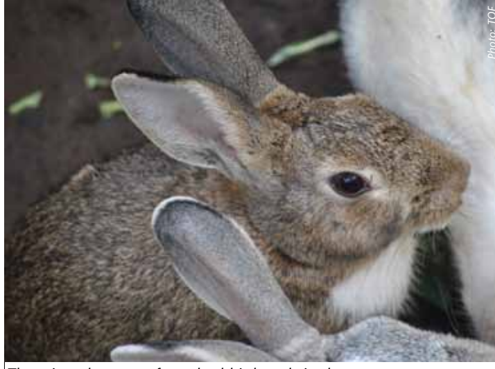
There is a shortage of good rabbit breeds in the country.

Organically grown rabbits have a higher nutritional value compared to conventionally kept rabbits (rabbits fed with conventionally produced feeds). To rear rabbits organically, one has to select their feed carefully. Rabbits can feed on weeds that goats feed on. On these feeds it is advisable to add Mexican Marigold; this plant contains