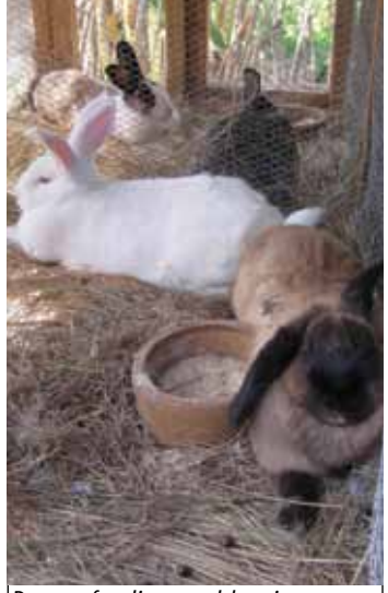
Proper feeding and hygiene improve rabbit productivity

Flemish Giant: Its colour is light grey or black blue. It weighs 6kg when fully grown. When cross-