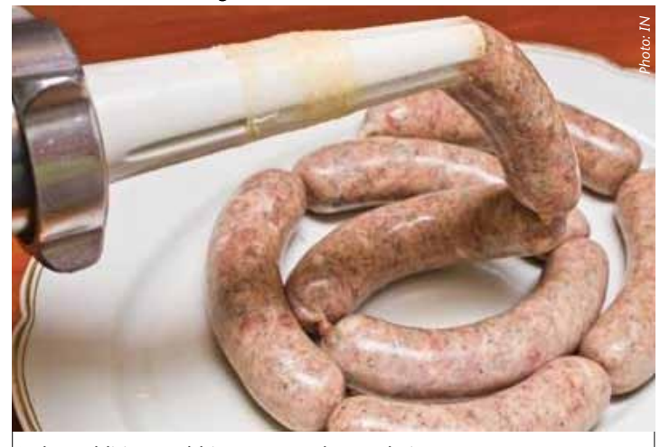
Value addition: Rabbit meat can be made into sausages.

turning it. When making sausages for sale, you want each sausage to have the same consistency and taste. Therefore you must carefully measure each ingredient according to instructions in your recipe.