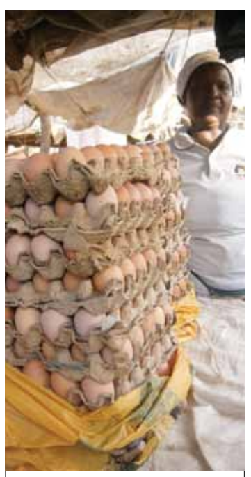
Eggs on sale in a market