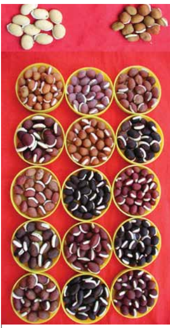
Varieties of dolichos

• They are an excellent source of vegetarian protein; good