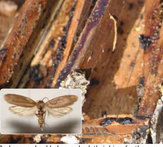
Beekeepers should always check their hives for the present burning the honey combs and cleaning the hives.