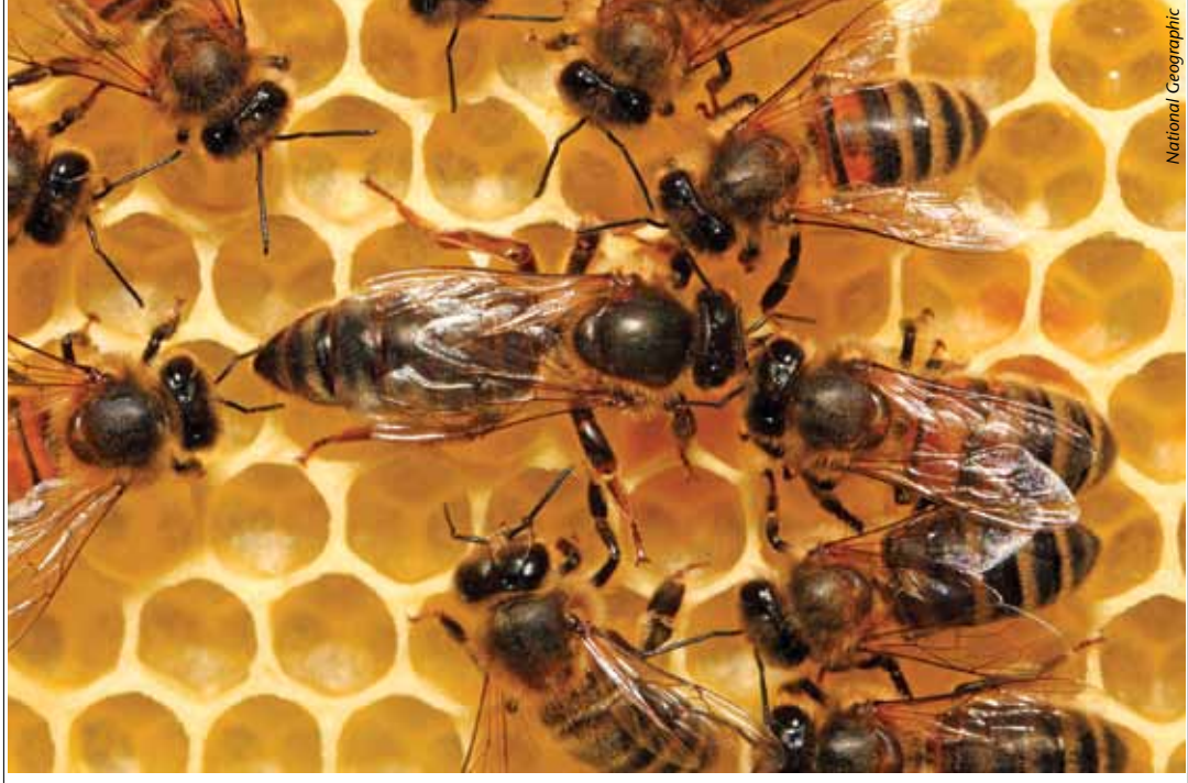
Farmers can get good harvest of honey and other bee products through proper management of bee colonies. In this way, bee pests and diseases can also be easily controlled.