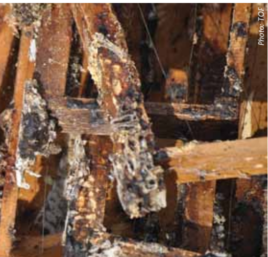
ce of wax moth which can be easily controlled by

which means possibly virus free apiaries.