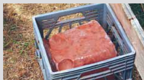
Licks last longer if placed in a holder.

in the sun for about two hours. After this, they should be removed from the moulds and left to dry indoors for 1-2 weeks depending on the weather.