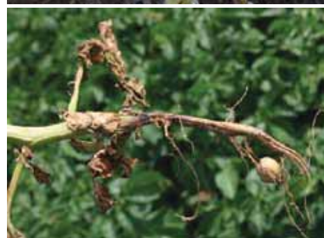
A potato plant infected by bacterial wilt (above). Diseased potato root and tuber.

Buy certified seed: Farmers should never buy potatoes meant for planting from their neighbours, if the potatoes are infected, the disease is transferred to your shamba. It is important to buy certified seed or from reputable potato growers who know more about bacterial wilt. New potato seeds should be planted in a field that has not been planted with potatoes the previous season.