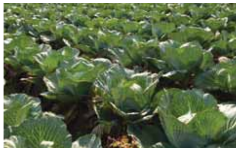
Cabbages planted in rotation with potatoes eradicates bacterial wilt from the soil.

Other farmers buy potato seed from their neighbours; if the seeds are infected, the disease is introduced into their farms. The disease can also spread if infected crop residue is transferred