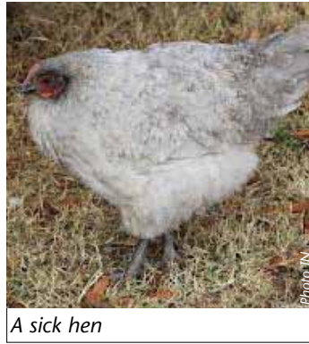
A sick hen

kill any disease-causing germs or viruses.