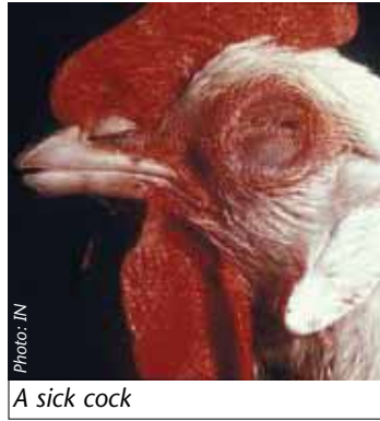
A sick cock

Maintaining hygiene is one of the most important steps a farmer can take to prevent diseases in their poultry flocks. The poultry house should be kept clean at all times. Ensure that the chicken droppings are swept every day. If possible, apply a disinfectant regularly to