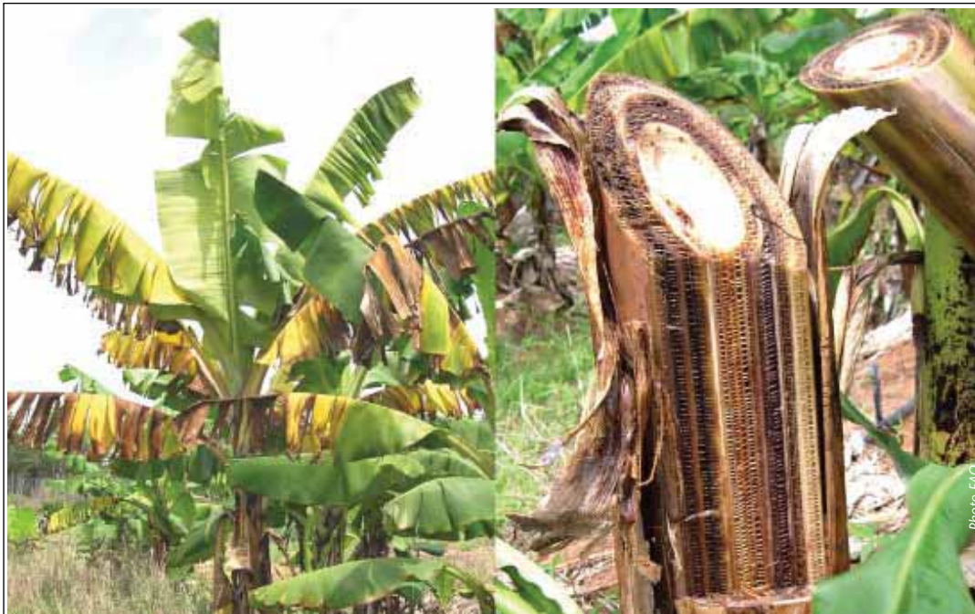
A banana plantation affected by the new strain of Panama disease.