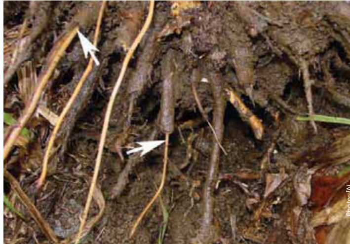
The white arrows show banana roots damaged by nematodes.

Nematodes feed on the root and the corm. They lay their eggs in the same region (around the root and the stem) where they take up to 30 days to mature. Infested suckers spread the pests especially during transplanting. Nematodes can also move from one plant to the other.