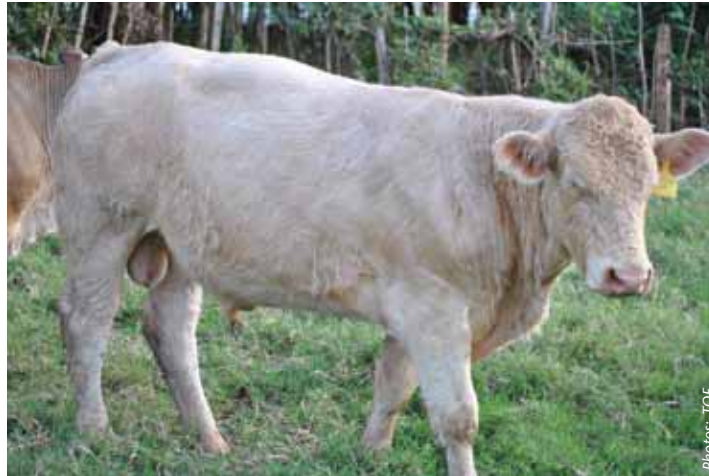
A Charolais bull at the Suam Orchards ADC farm, Kitale.

The breed has experienced challenges in adapting in Kenya mainly because it easily gets tick borne diseases like East Coast Fever (ECF). Farmers are