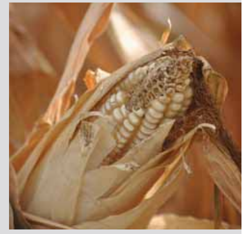
After maturity the maize cob opens exposing it to aflatoxins, rotting and pests (above). Even healthy looking maize may have aflatoxins (below).