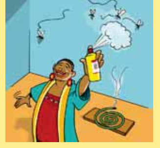
Avoid getting bitten by mosquitoes. Use mosquito repellents to keep them