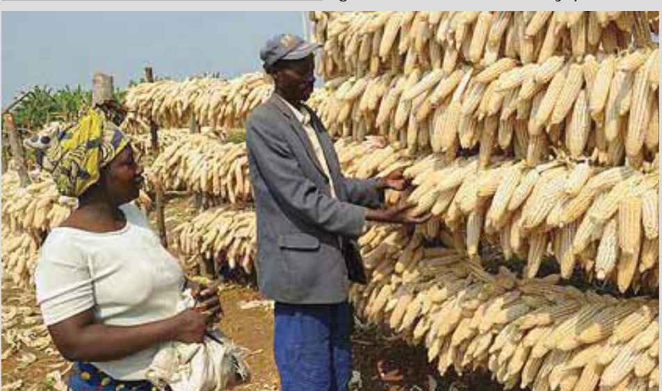
out the maize. Remove all rotten maize It is advisable to dry your maize before storage to avoid aflatoxins infection and rotting.

The Aspergillus flavus fungus invades and infects developing maize grain in the field before harvest, especially when the maize remains too long in the field; that's a reason why maize should be harvested early. The fungus affects mature grain during harvest and in storage as well,. In stored maize, the fungus can develop further through improper grain drying and unhygienic storage practices. Pre-harvest contamination with aflatoxins is aggravated by drought stress and elevated temperature during seed maturation. Damage through broken grains and holes drilled by pests such