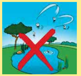
Drain stagnant water. It provides suitable conditions for mosquitoes to