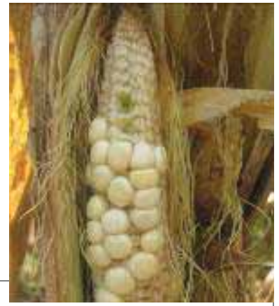
These are some of the signs of the Maize Lethal Necrosis Disease (MLND)