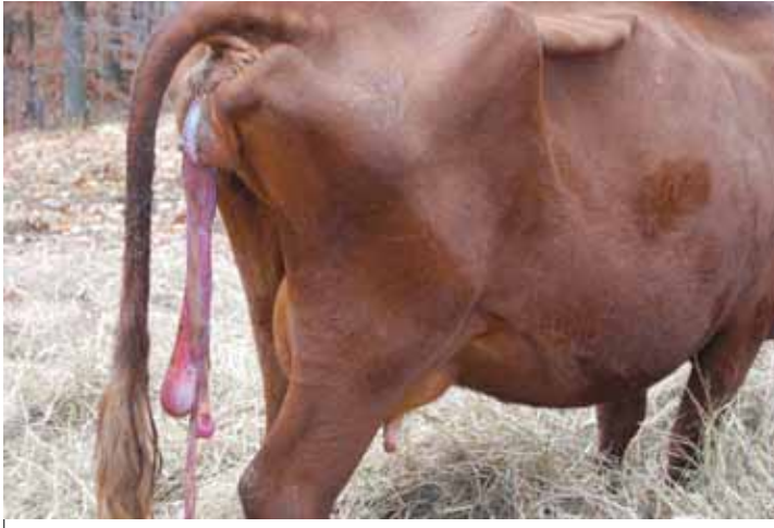
Placenta retention in dairy cows can be caused by many factors. (IN)

Their expulsion then depends on the speed of the normal shrinking of the uterus. It is normally easy to diagnose a cow with retained placenta by looking at the degenerated, discolored and unpleasant-smelling membranes hanging from the vulva more than 24 hours after calving, one can confirm a case of retained placenta. Occasionally, the retained membranes may remain