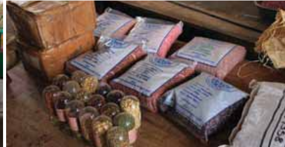
Tonnes of seeds for maize, beans, green gram etc. are stored in Kari Katumani.