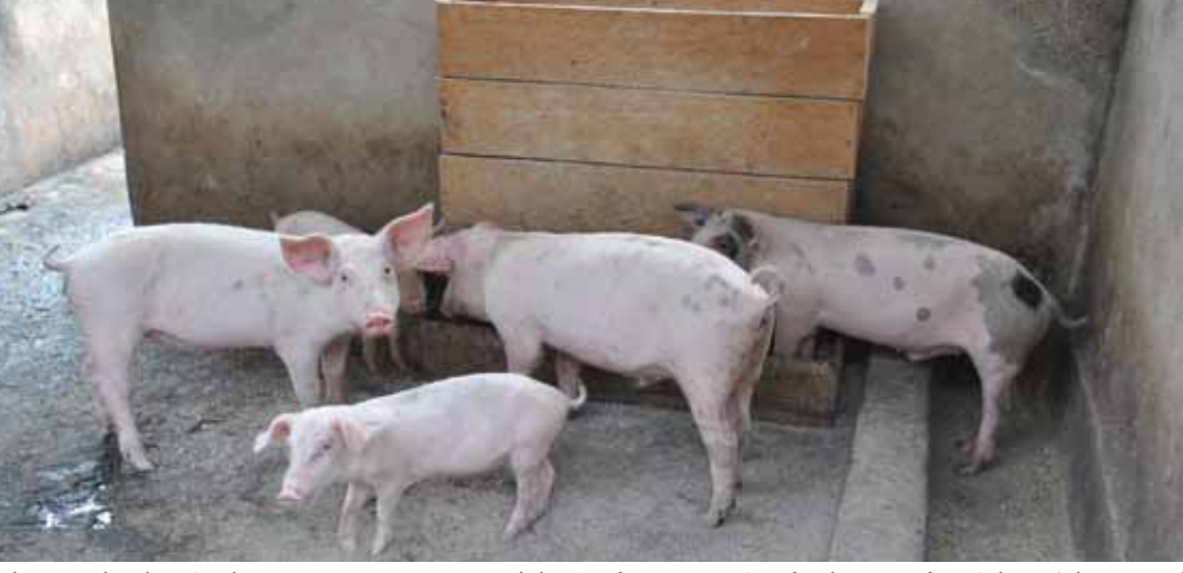
The wooden box in the creep area prevents adult pigs from accessing feed meant for piglets

Young pigs do not take much in terms of solid feed because they get all their nutritional needs from their mothers milk. Introduce starter feeds to piglets after one week so that they learn how to feed early. To ensure piglets get enough milk from suckling during the early stages of growth, farmers should give the sows adequate and balanced feed to ensure they produce adequate milk for the piglets at least 9kg sow and weaner per day divided three times a day if it has more than 10 piglets. At three weeks after farrowing (birth), the farmer should castrate all male piglets if they are meant for sale to pork processing companies such as Farmers Choice Ltd market and train them to eat solid feeds early.