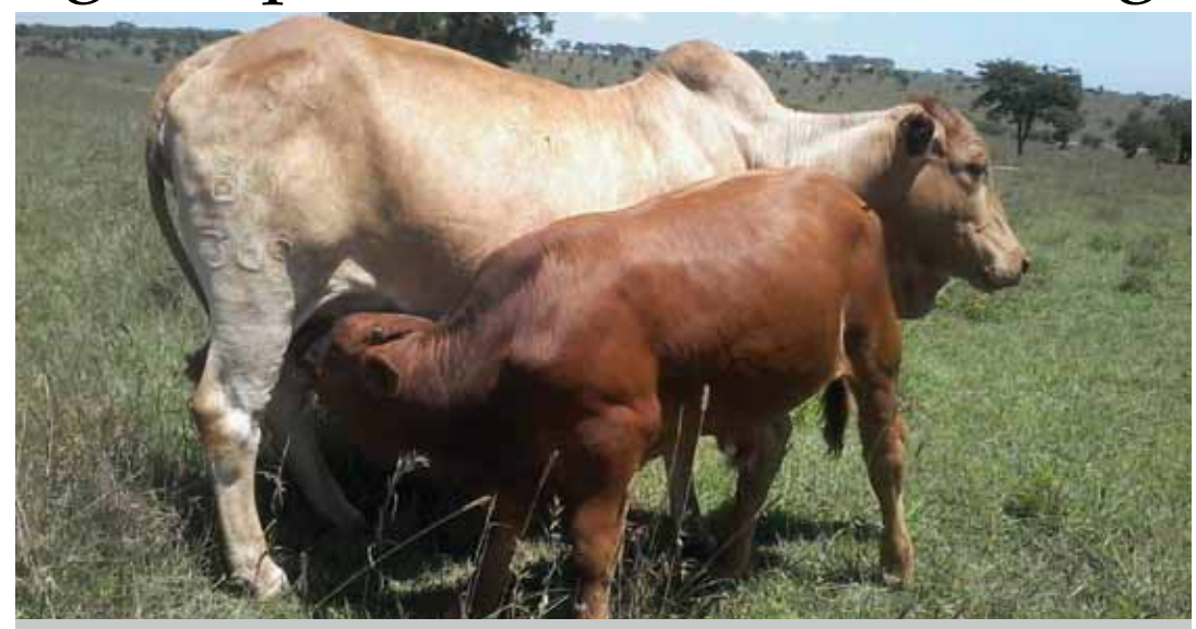
A four month old Fleckvieh/Boran cross suckling at Olooltepes ranch.

Josphat Chengole | Reliable feed and water are the major challenges in beef farming. Fodder is usually plentiful during the wet seasons and limited during the dry season. At the same time, the natural pastures that support most of the livestock production in the Arid and Semi-Arid Lands (ASALs) are being degraded due to poor management systems. During the wet season feed is plentiful and often exceeds the demand, resulting in waste. In the dry season and drought spells, the demand for fodder exceeds the supply. To keep their animals in good shape throughout the year, beef farmers must conserve fodder by making hay and