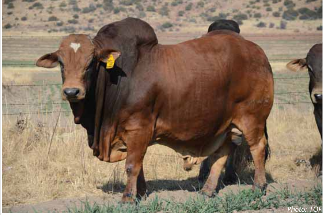
Kenya has a huge potential for beef farming. However, large parcels of land that could be used for this purpose lie under utilised. Careful selection of the right breeds combined with good range man agement practices can transform the livestock sector and make Kenya a net exporter of beef. Page 3