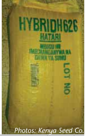
To a farmer, the above two seed packages may appear the same but the seed package on the left is genuine and one on the right is fake

KEPHIS inspectors raided a The KEPHIS inspectors may major supermarket in Kitale town where a large consignment of fake seeds was confiscated and the owners of the supermarket arrested. But trade in fake seeds continues despite the arrest of individuals involved in fake seed business cartels.