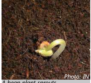
A bean plant sprouts in coconut coir medium.

Coconut coir is a natural fibre extracted from the outer shell of coconut husk. It has a natural pH which enables plants to grow in a way healthy way. Coconut coir is free of bacteria, plant diseases, fungi, weeds and other pathogens that interfere with plant growth. The coconut coir is mainly used as a soil additive; due to its structure, it provides plants sufficient space for air circulation while maintaining excellent water retention capacity, which prolongs the lifespan of the soil and slows down the decomposition process. It also helps to absorb water, keeping the soil moist and fertile. If the soil is sandy coir helps to reduce moisture loss by keeping moisture close to the plant roots. In clay soils, coconut coir creates air spaces in the hard packed soil so that crops.