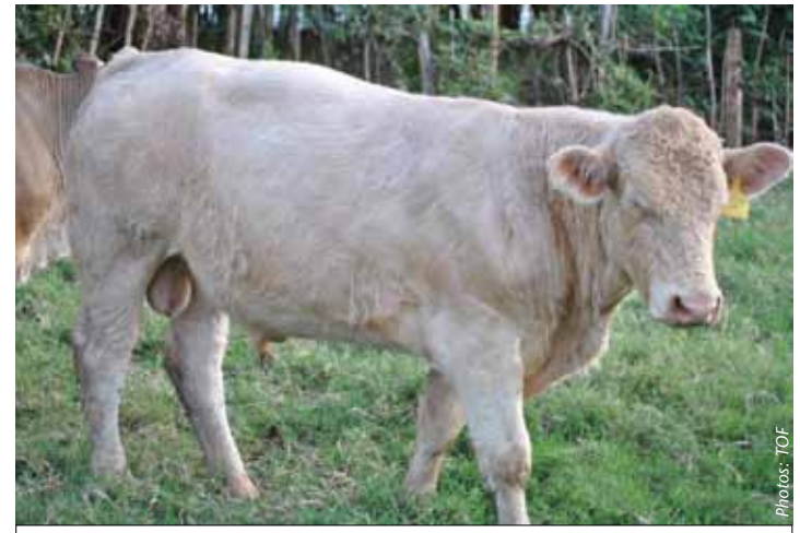
A Charolais bull at the Suam Orchards ADC farm, Kitale.

The breed has experienced challenges in adapting in Kenya mainly because it easily gets tick borne diseases like East Coast Fever (ECF). Farmers are