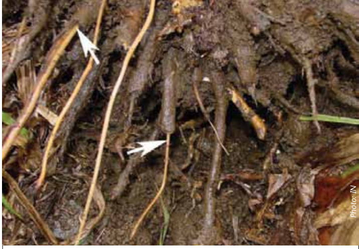
The white arrows show banana roots damaged by nematodes.

Nematodes feed on the root and the corm. They lay their eggs in the same region (around the root and the stem) where they take up to 30 days to mature. Infested suckers spread the pests especially during transplanting. Nematodes can also move from one plant to the other.