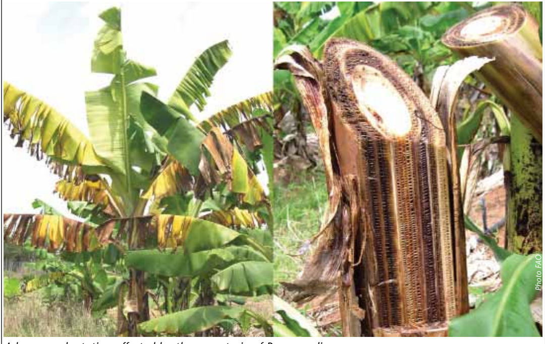
A banana plantation affected by the new strain of Panama disease.

The magazine for sustainable agriculture in East Africa