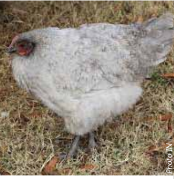
A sick hen