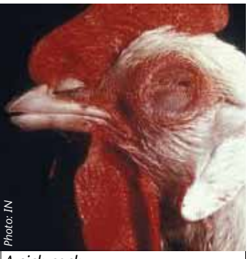
A sick cock

Maintaining hygiene is one of the most important steps a farmer can take to prevent diseases in their poultry flocks. The poultry house should be kept clean at all times. Ensure that the chicken droppings are swept every day. If possible, apply a disinfectant regularly to