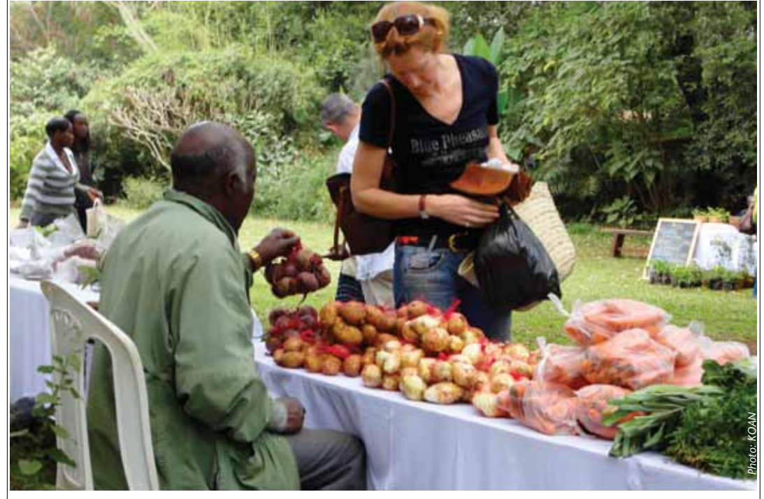
The market for organic products is growing so fast that farmers are unable to meet the demand.