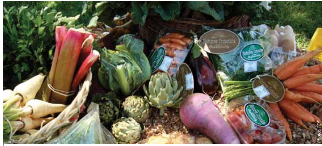
Organic production has not kept pace with the big demand for organic products.

Small- scale farmers groups that would like to sell their produce should know that it is not possible for farmers to market their organic produce