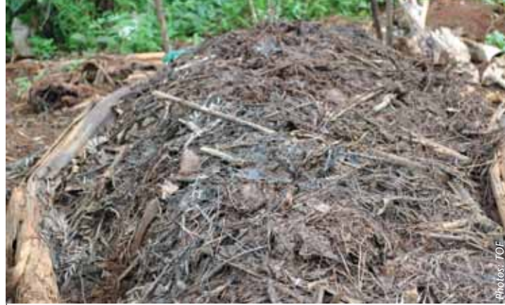
If made the right way, compost can meet all your fertilizer needs