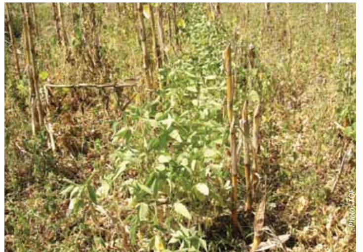
Conservation agriculture promotes permanent soil cover to protect and conserve soil structure. Animal drawn planter (below, right).

crop residue and related organic material on the farm. There are certain compelling factors that have made some farmers adopt conservation agriculture. These include: