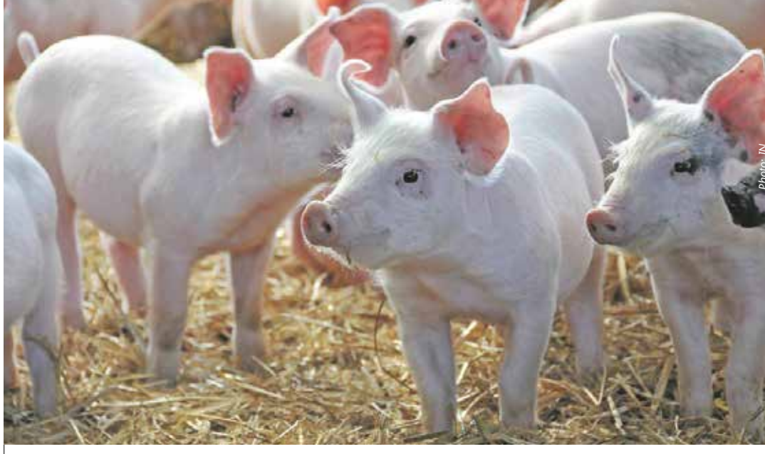
Healthy piglets fed on well formulated feeds mature early