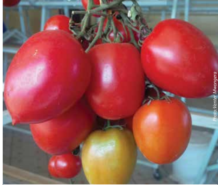
Cherry tomatoes grown within a greenhouse and sprayed with Sodom apple extract to control pest and disease