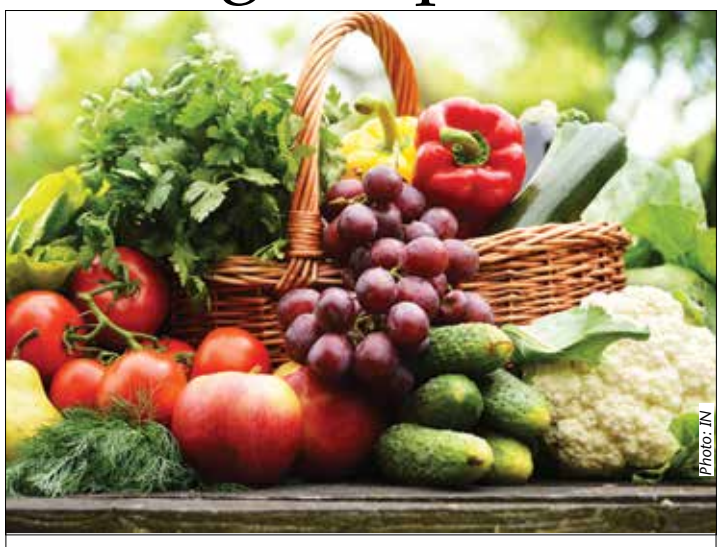
Organically grown vegetables, on sale in an organic store

PGS is the better option for farmers groups. Farmers sell their