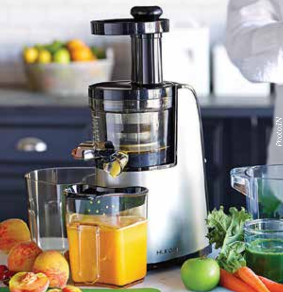
Healthy juice extracted from vegetables

While blending is putting all the fiber and proteins from the