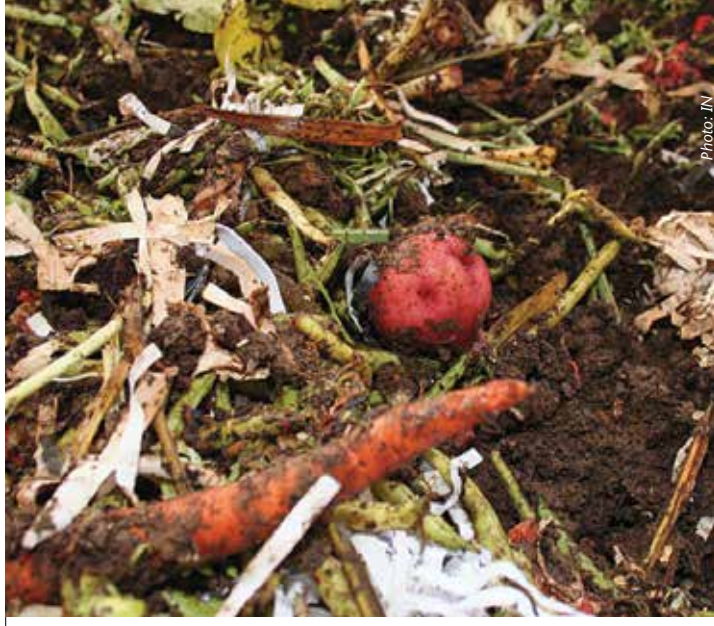
Kitchen waste being recycled into compost manure