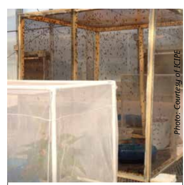
Fig: Breeding cage

fore, unlike house flies, they cannot carry disease between wastes and foods consumed by humans. This also makes them safe to feed to our animals.